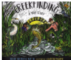
Creeksfinder , 2018 GEBA Winner

This list from The Nature Generation of past winners of their annual Green Earth Book Award , which is given to children's and young adult titles.